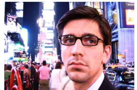
Warner adrift in Times Square

MADE IN NY - Though The Man With Midnight Eyes is the fourth feature project for Manhattan-based Black Kraut Productions, it was their first full-scale feature filmed in New York City. The production team was honored to work with the NYC Mayor's Office of Film, Broadcasting and Theatre and thrilled to shoot in the city they're proud to call home. The Man With Midnight Eyes was also an incredible opportunity to work with local businesses and organizations, like Norman's Sound & Vision music store on the lower East Side where one of the opening scenes of the film was shot and Brooklyn-based rock group The Sad Little Stars that generously gave Black Kraut permission to use their award-winning song "Don't Fuck With Love" in the film's soundtrack.