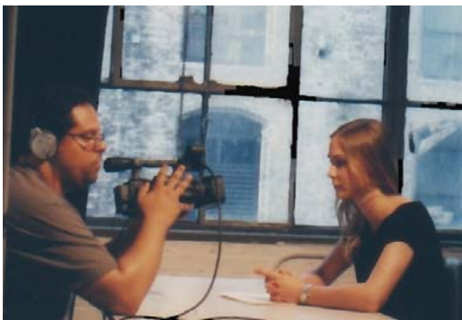
Hencke adjusts a handheld shot on actress Brie Walsh. The compact size and weight made the V1U ideal for Hencke's fluid, naturalistic shooting style

WHERE ART AND TECHNOLOGY MEET - The Man With Midnight Eyes was filmed in incredible 24p High Definition using the newly released Sony HVR-V1U camera, making Midnight Eyes the first of Black Kraut Productions' four features ever shot in HD. The Sony HVR-V1U captures all the beautiful image clarity of HD while maintaining the true film appearance of 24p digital photography. The Man With Midnight Eyes was one of the first features ever completed using this new technology.